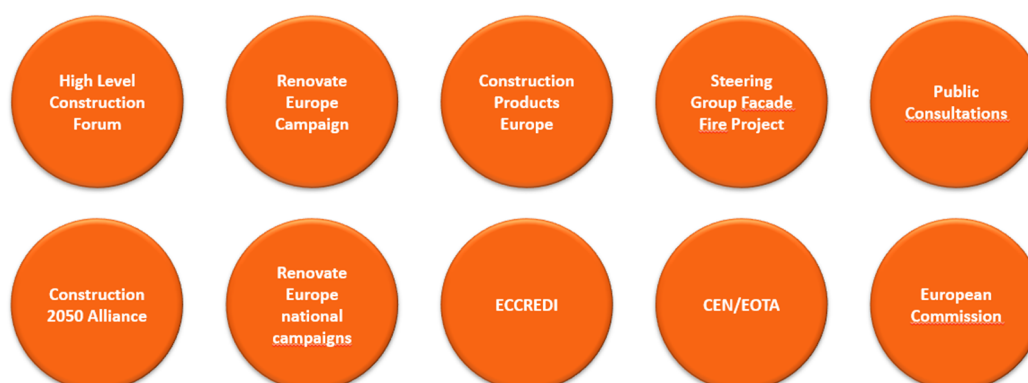
Figure 2: examples of EAE's representations

EAE and its working bodies are involved in the decision-making process both on European level and via our members on national level. EAE contributes directly and together with partners thanks to its broad network.