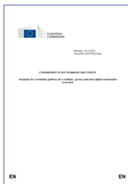
EAE contribution to consultation on SWD transition pathway for a resilient, greener and more digital construction ecosystem