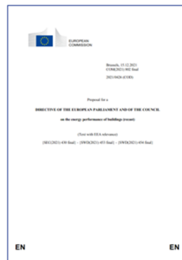
EAE contribution to consultation on EPBD revision