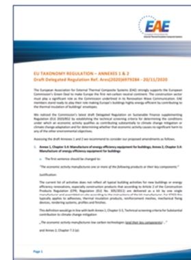
EAE position on draft CPR revision